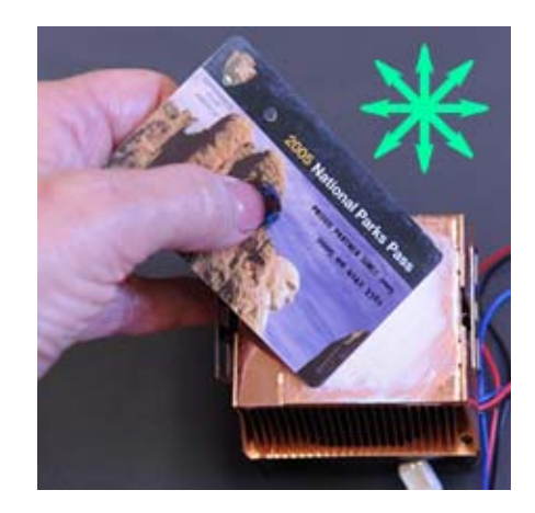
Photo HS1 shows Céramique being used however, the method of tinting a heatsink or metal cap is the same for Arctic Silver 5, Arctic Alumina and Matrix Thermal Compounds. Determine what area on the base of the heatsink will contact the CPU cores once the heatsink is mounted.